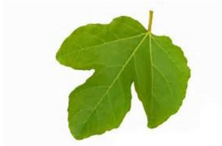
Fig leaf coverings for guilty conscience ... What are the present day “fig leaves” ?